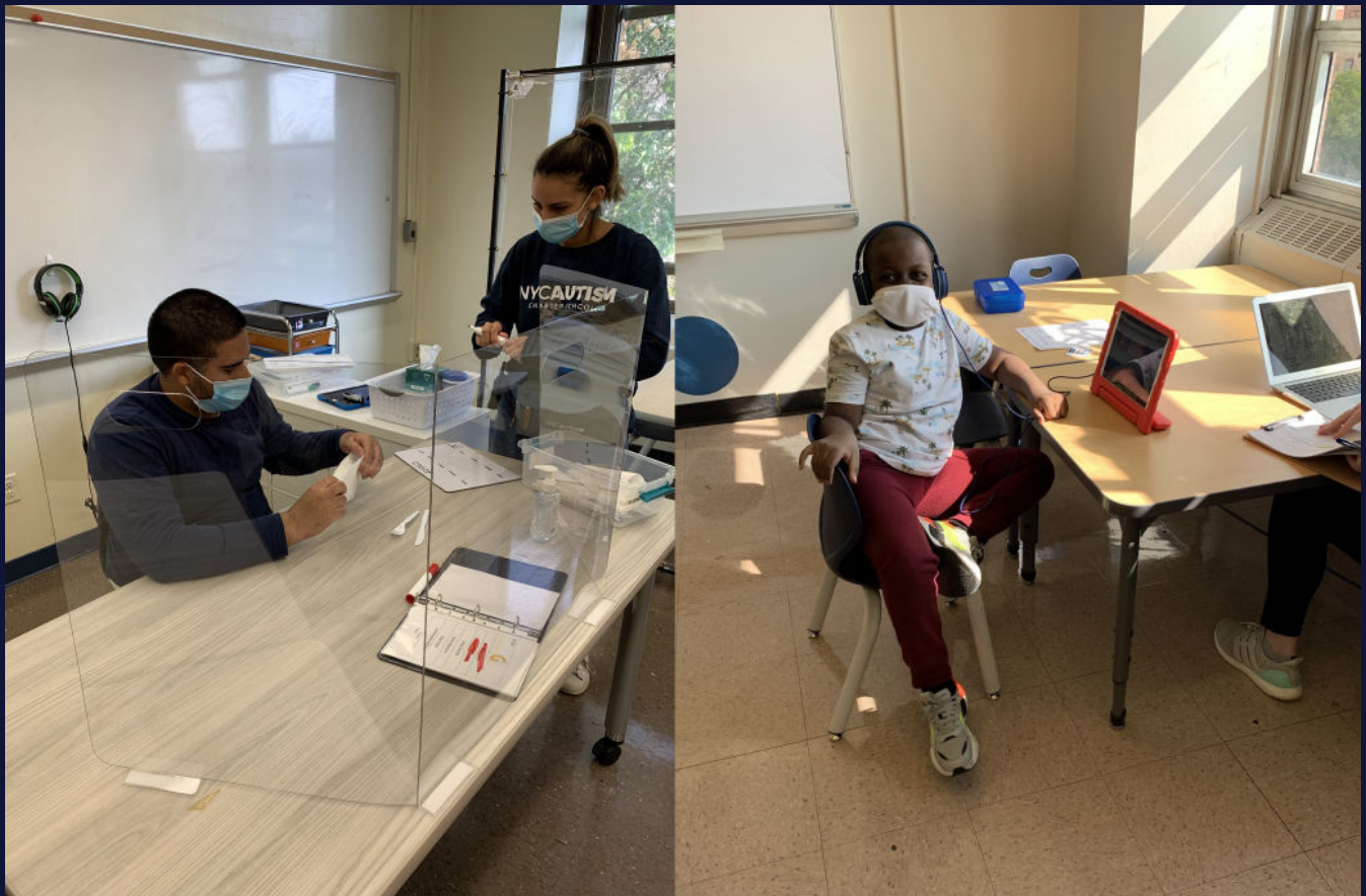
- The NYC Autism Charter School Responds to COVID-19 -